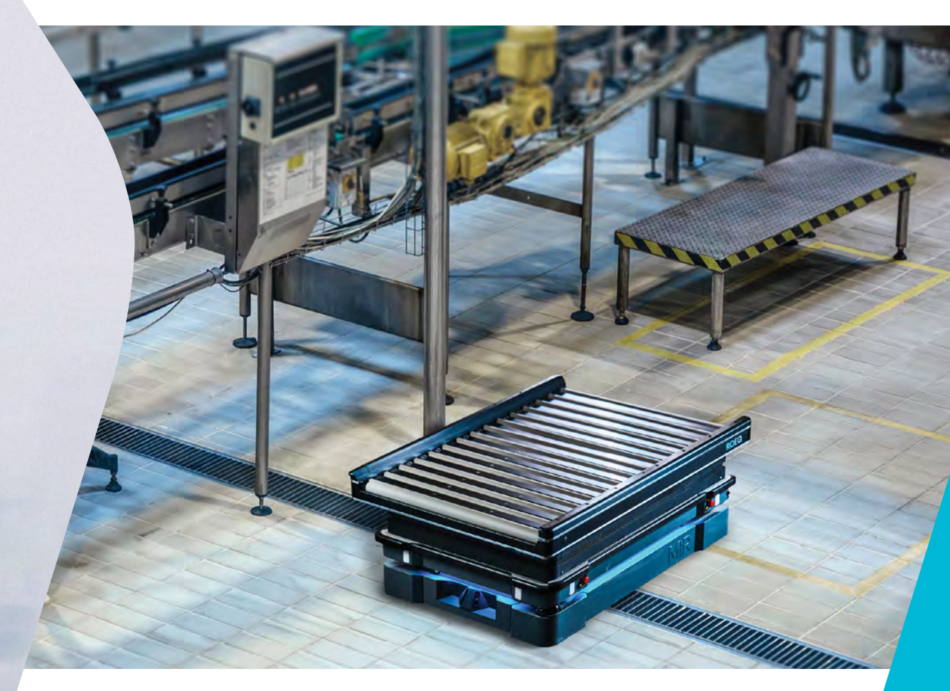
The ROEQ TR500 Auto is ideal for transporting and transferring between conveyor lines of different heights.