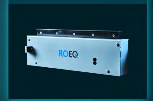
CLICK TO SEE MORE >