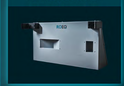
CLICK TO SEE MORE >