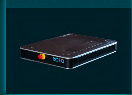
CLICK TO SEE MORE >