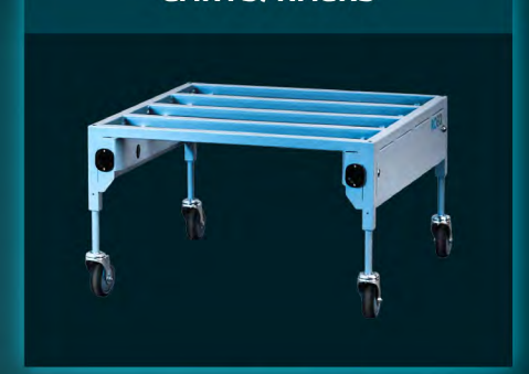
CLICK TO SEE MORE >