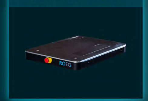
CLICK TO SEE MORE >