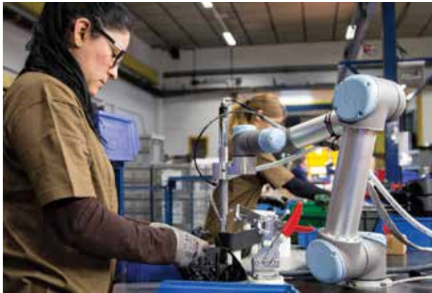
Collaborative robots work safely next to people.